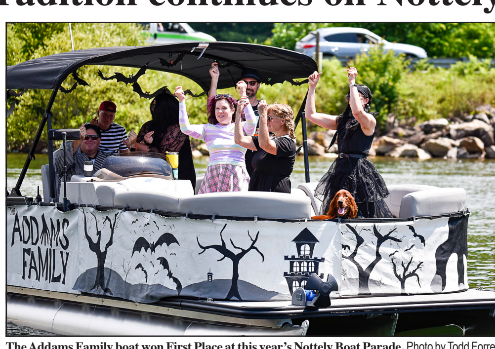
The Addams Family boat won First Place at this year's Nottely Boat Parade.

present day and the Suches Fire Department has taken over the acquisition and handling of the fireworks, which is probably a safer alternative. Meanwhile, the festivities have moved a quarter mile north to Woody Gap School, allowing for larger crowds to soak up a July 4 celebration that perfectly illustrates the essence of an However, the firework American success story.