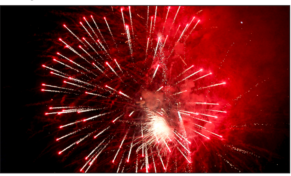
Thousands of people from all over the area enjoyed the pyrotechnic wonders provided by the annual "Red, White & Blairsville" fireworks show on the Fourth of July.

to me, but I guess the bottom line is (that) it's a time of celebration of our freedoms sacrifices made by so many for us to have (those freedoms).