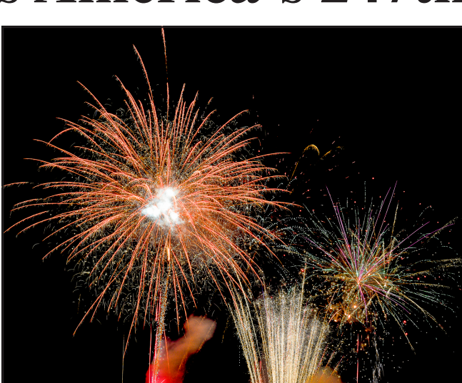
To the delight of many, the dedicated firefighters of Union County Fire Station No. 5 in Suches volunteer every Fourth the areas around the parking of July to launch fireworks at Woody Gap School.

Hours before the first explosion echoed through southern Union County, chairs began unfolding on and around the field behind Woody Gap School, eventually filling See Suches Fireworks, Page 6A