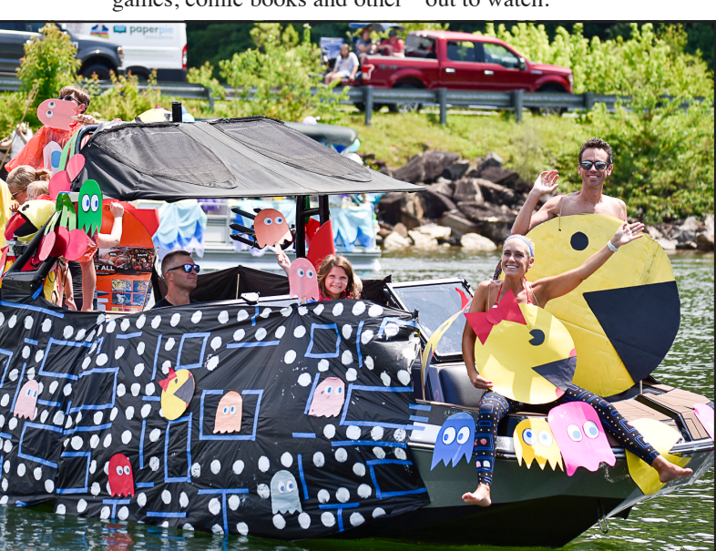
This boat decorated like the famous Pac-Man game came in runner-up in the 2023 Boat

putting this on each year and we're glad so many people television, film, musicals, video enjoy taking part and coming