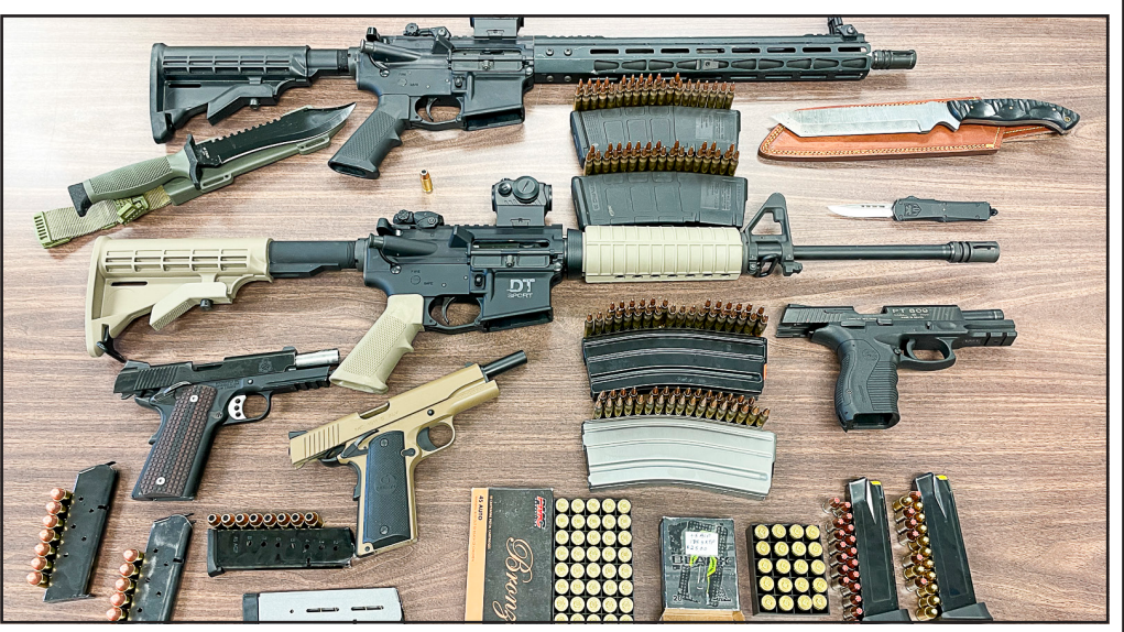
The Sheriff's Office confiscated a small arsenal from the North Carolina men who drove to Meeks Park last week to settle a personal dispute.